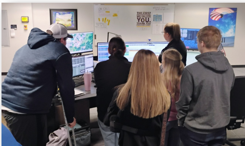
At the Douglas County Dispatch Center.