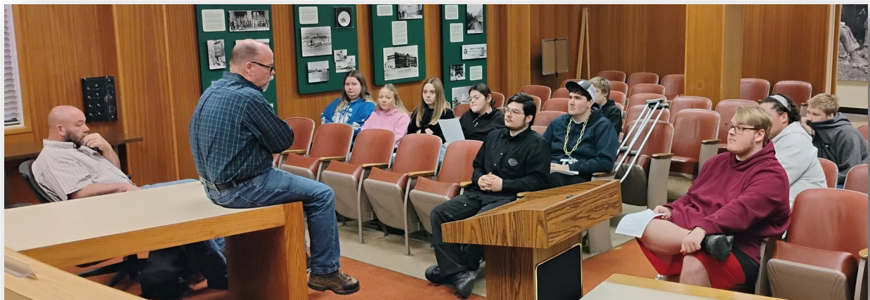
Attendance at the County Commissioners meeting.