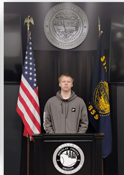
Tommy gives a press conference in the emergency meeting room.